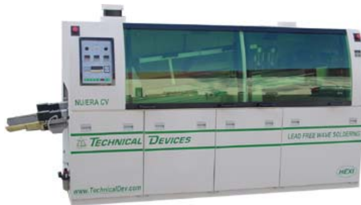
16-Inch Process Width PLC Wave Soldering Machine