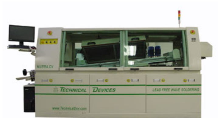
16-Inch Process Width Wave Soldering Machine ( actual machine may differ from picture above)