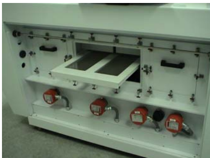
Easily Accessible Immersion Heaters and Catch Screens (Shown with Front Panel Removed)