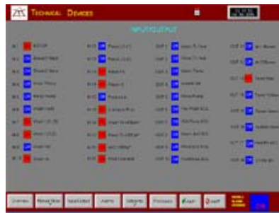
Input / Output Screen