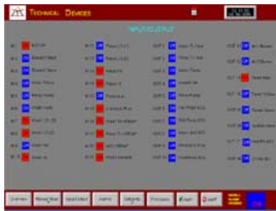
Input / Output Screen