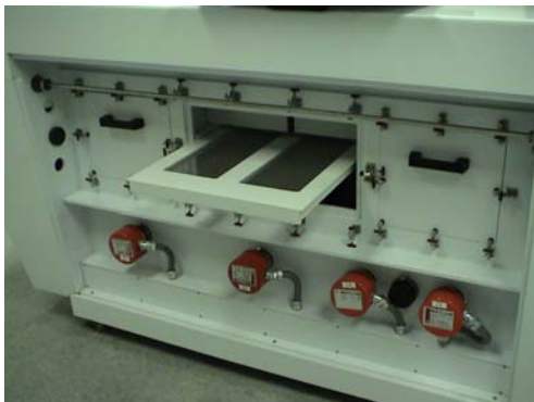
Easily Accessible Immersion Heaters and Catch Screens (Shown with Front Panel Removed)