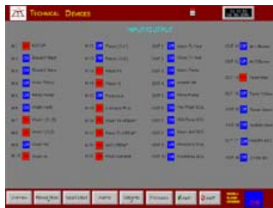
Input / Output Screen